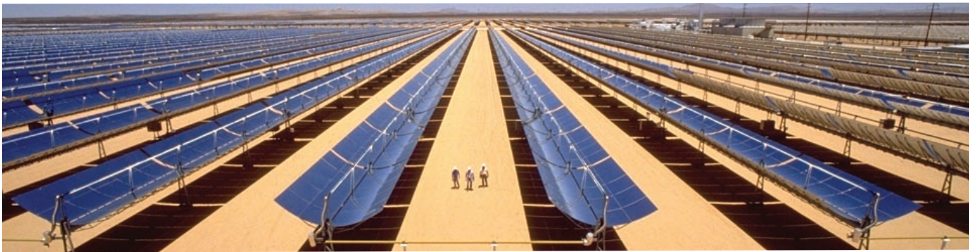
A 30 MWe parabolic trough power plant located at Kramer Junction, California.

technologies have helped to increase interest in this technology around the world. New parabolic trough plants are currently under development in support of solar portfolio standards in Nevada and Arizona, and a solar tariff premium in Spain. Although parabolic trough technology is the least cost solar power option, it is still more than twice as expensive as power from conventional fossil fueled power plants at today's fossil energy prices in the United States.